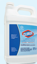
4/128 oz. Gallon UPC: 31651