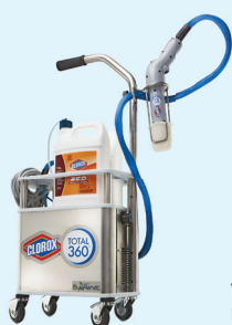
1 Unit UPC: 60010