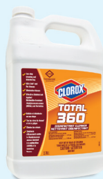
4/128 oz. Gallon UPC: 31650